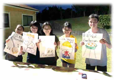
↑ Exchange program ↓