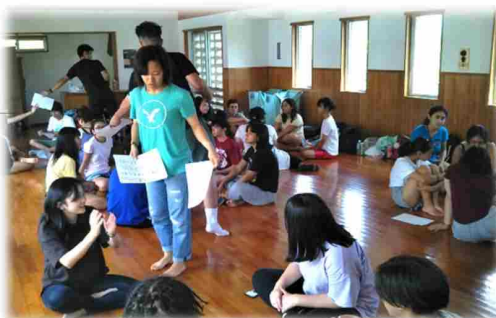
↑ Midpoint reflection ↓