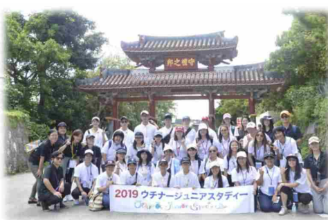
↑ Shurijo Castle ↓