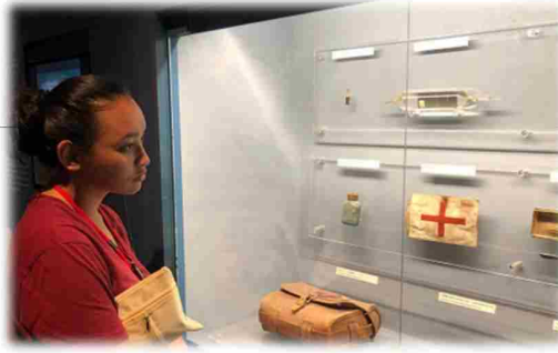
↑ Himeyuri Peace Museum ↓