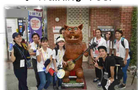
↓ Traditional craft (bingata) experience