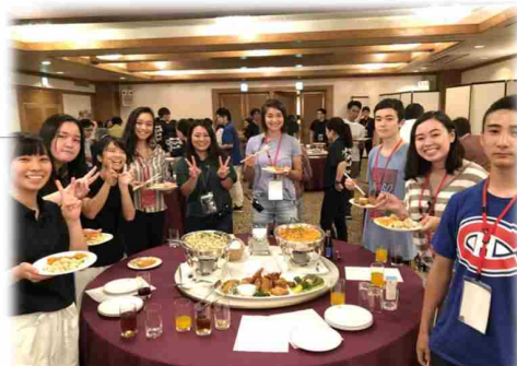
↑ Welcome party ↓