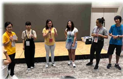
↑ Immigration studies ↓