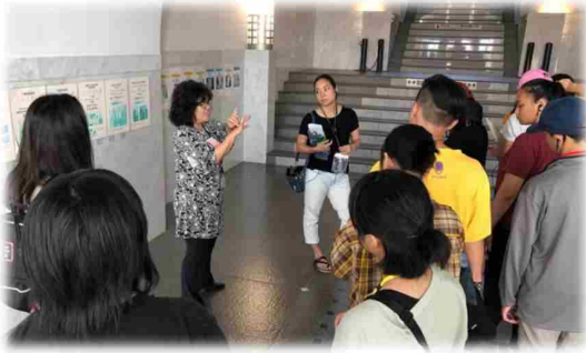
↑ Peace Memorial Museum ↓