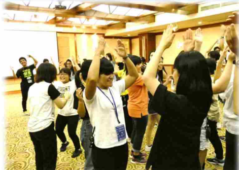
↑ Exchange program ↓