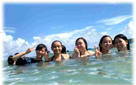
↑ Beach activity ↓