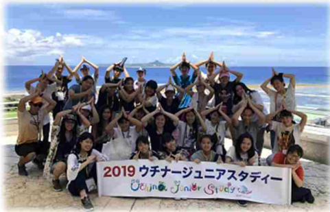
↑ Aquarium visit ↓