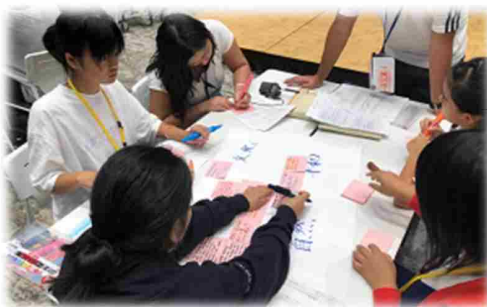
↑ Immigration studies ↓