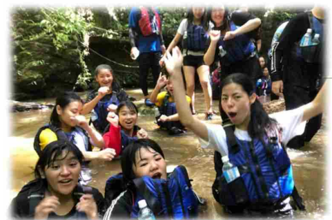
↑ River trekking ↓