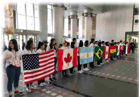
↑ Welcome ceremony ↓