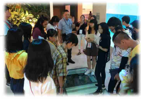
↑ Prefectural museum ↓