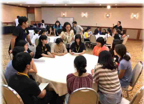
↑ Immigration studies ↓