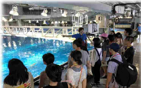
↑ Backyard tour Dolphin show ↓